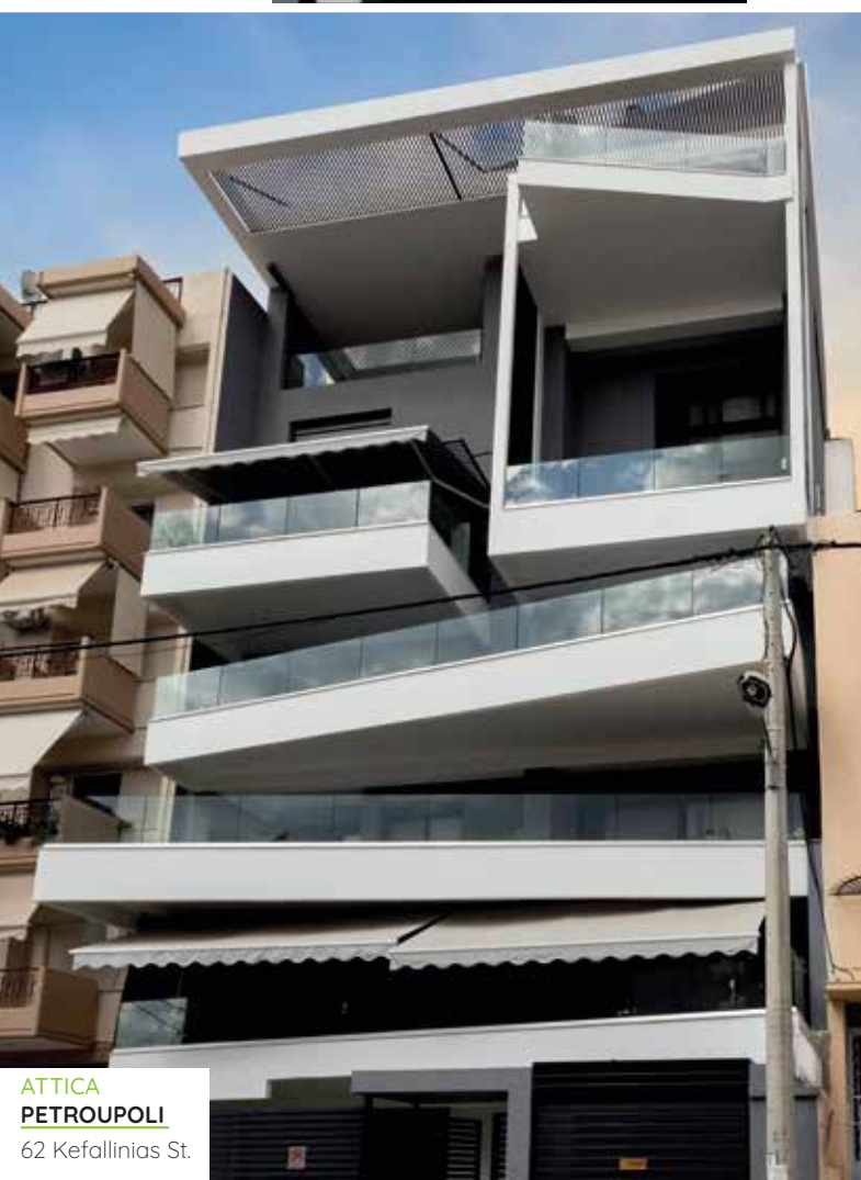
ATTICA PETROUPOLI 62 Kefallinias St.