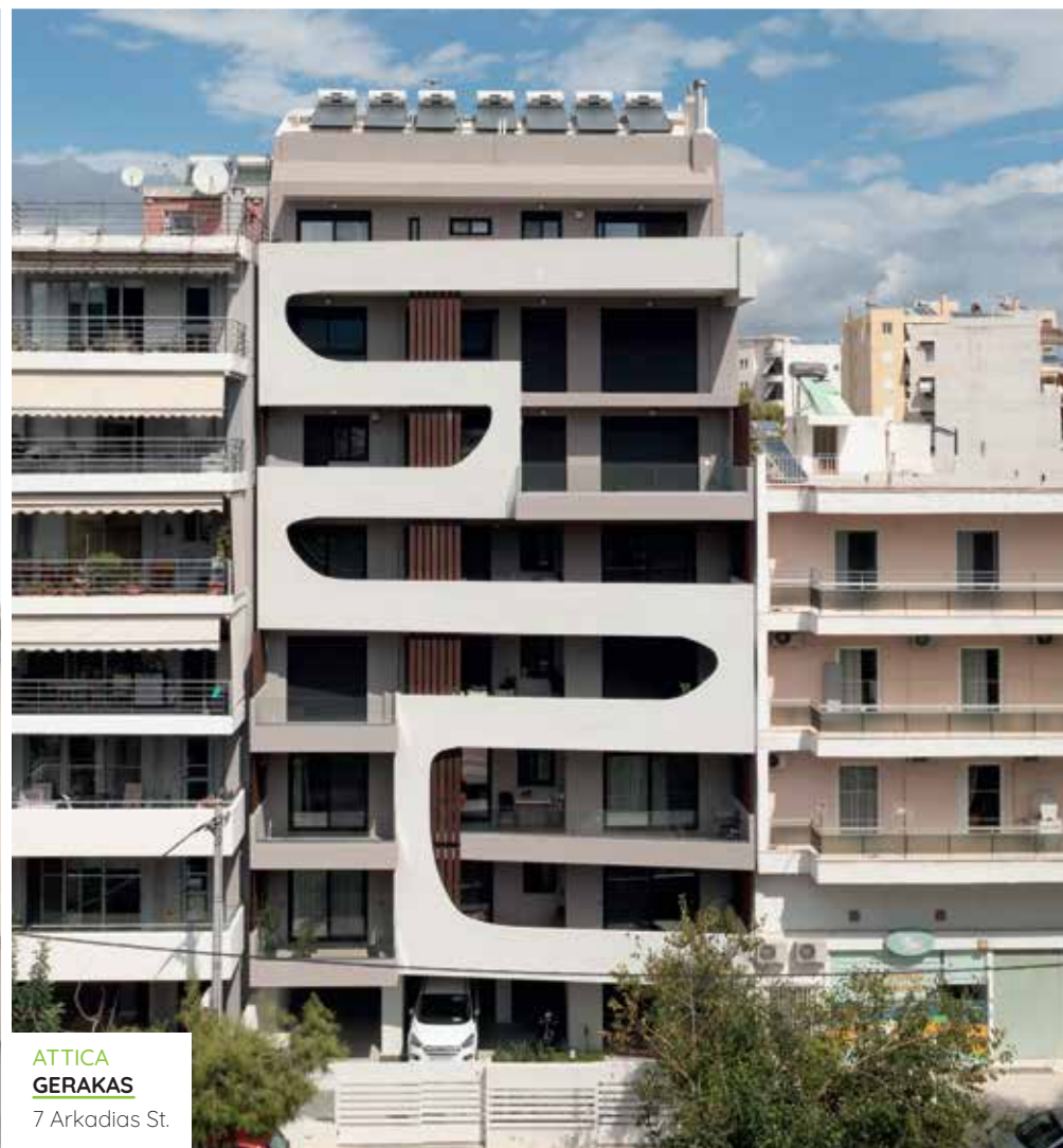
ATTICA GERAKAS 7 Arkadias St.