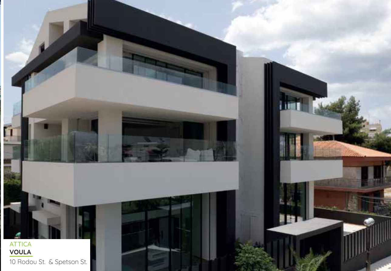
ATTICA VOULA 10 Rodou St. & Spetson St.