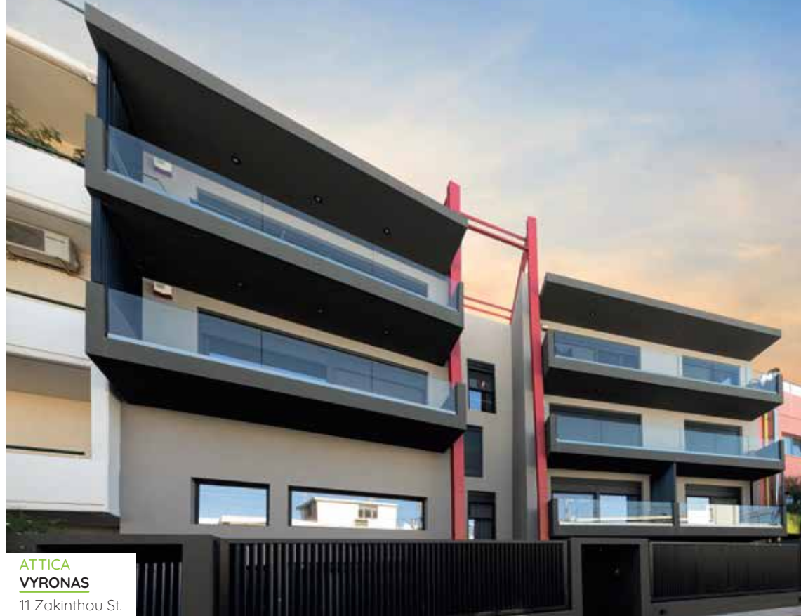
ATTICA VYRONAS 11 Zakinthou St.