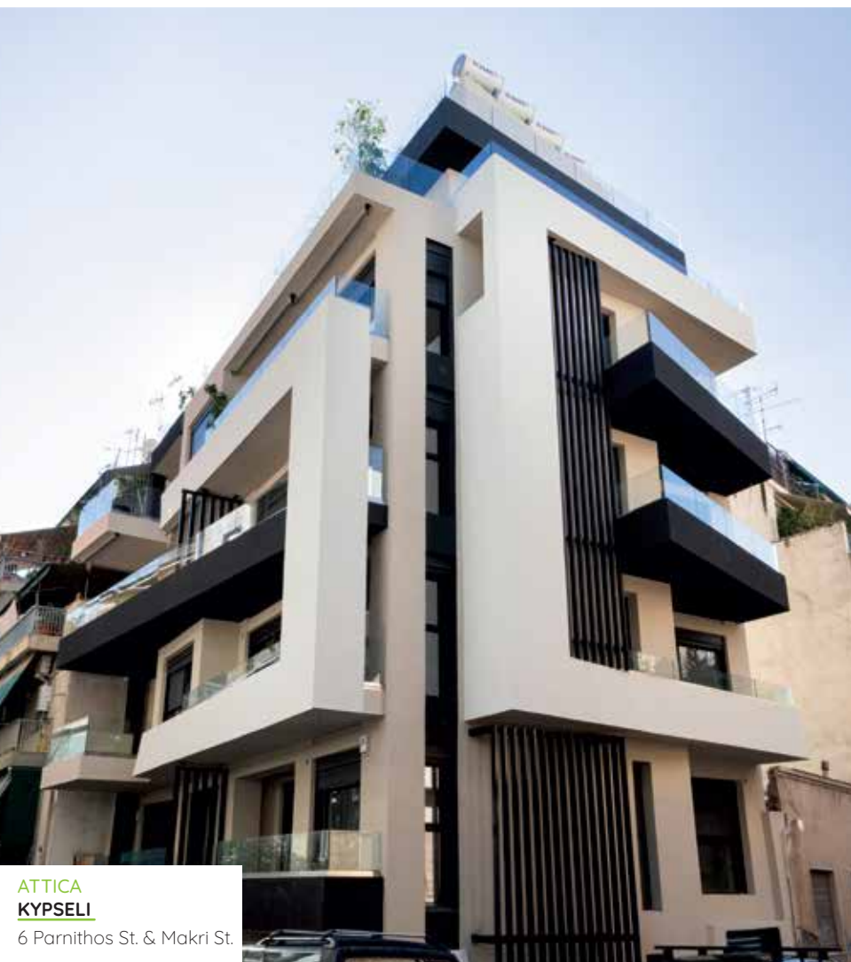
ATTICA KYPSELI 6 Parnithos St. & Makri St.