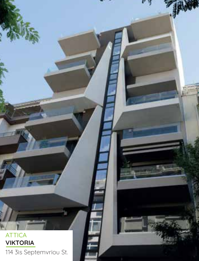
ATTICA VIKTORIA 114 3is Septemvriou St.