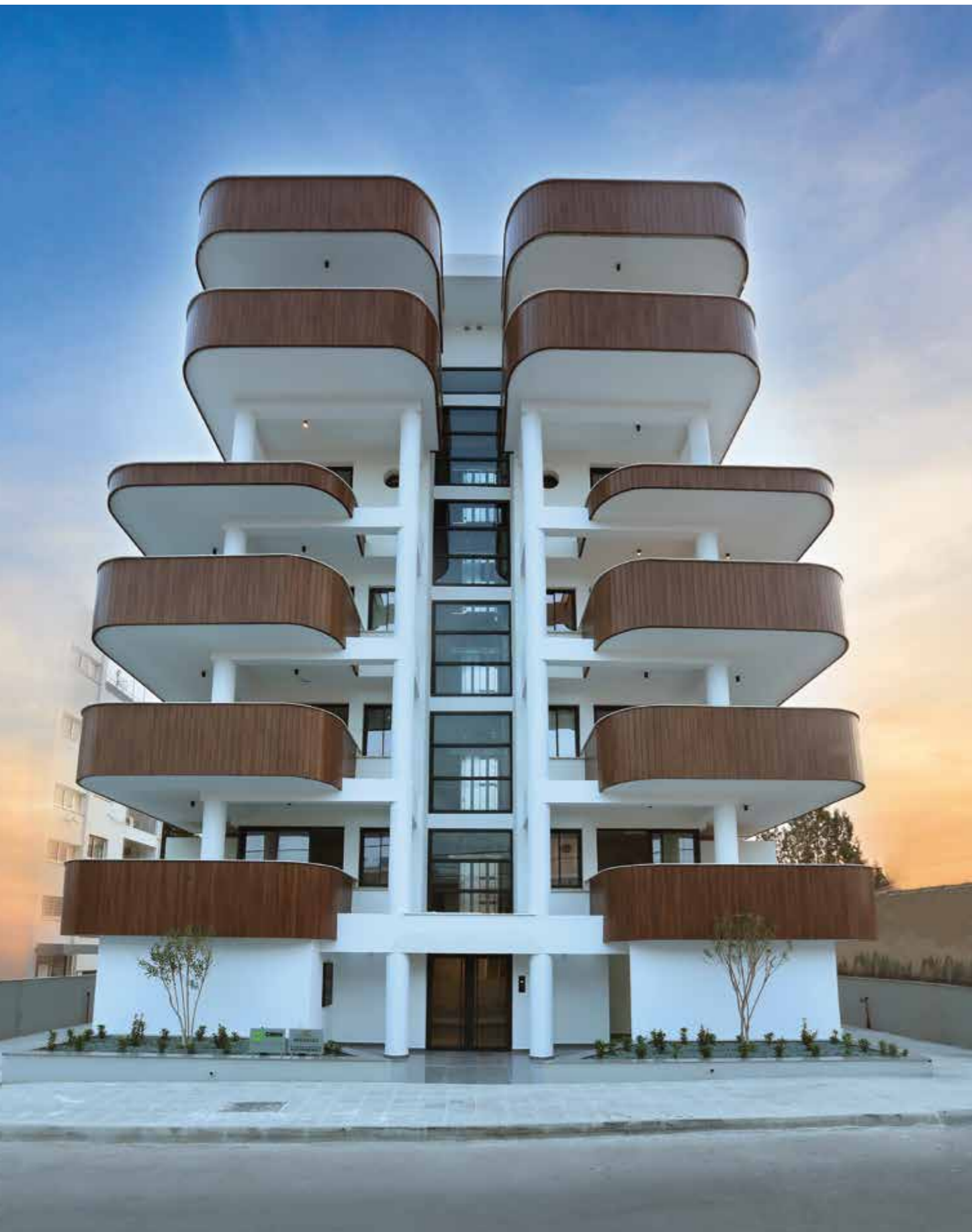
Thea RESIDENCE NICOSIA 2 AGIOS SPYRIDONOS ST., LYCABETTUS